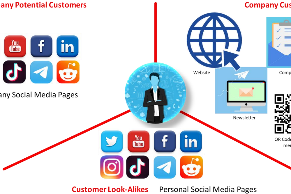
Customer Look-Alikes Personal Social Media Pages